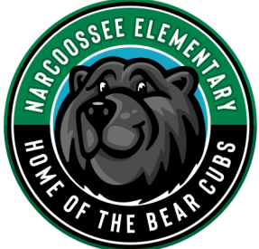
"NCES-Where a foundation is built for a successful future.