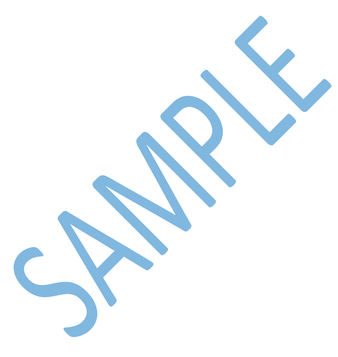
EXHIBIT "A" <u>LEGAL DESCRIPTION AND MAP DEPICTING LOCATION</u>